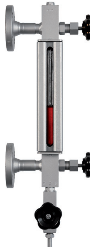
Sight glass level indicator model LGG

The glasses and/or mica discs as well as the seals are fitted, secured and sealed with the aid of screws and a cover. Glasses are used in accordance with DIN 7081, meaning to max. temperatures of 243 °C (280 °C with mica design) for steam, up to 300 °C for other media, to 450 °C in special circumstances.