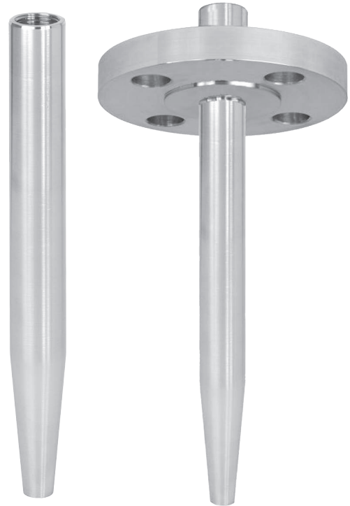
Fig. left: Weld-in thermowell, model TW55-6