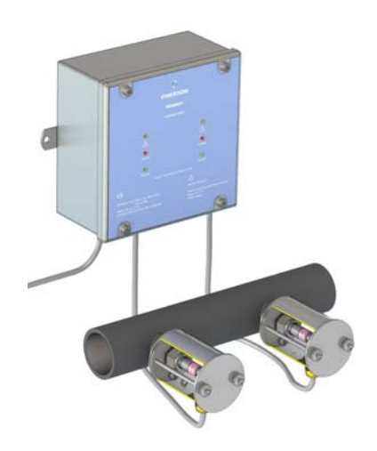
A Hydratect installation