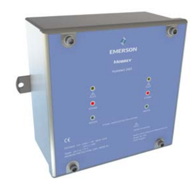
Hydratect control unit

Typical applications are high and low level alarms and trips on steam drums, feed heaters, de-aerators, condensate pots etc, and turbine water induction prevention system (TWIP) on steam lines.